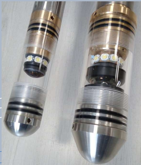
38mm Lens / 52mm Lens

This enables a complete visual appreciation of the target zone in terms of lithology, mineralisation, alteration, to develop a structural model of an ore body and host rocks based on an analysis of the different types of discontinuities present.